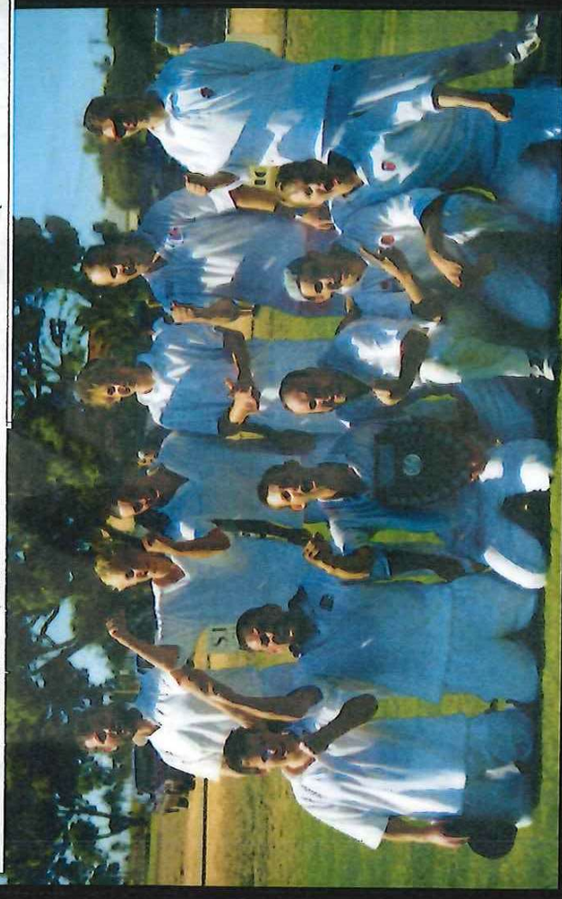
A2 PREMIERS LEGENDS