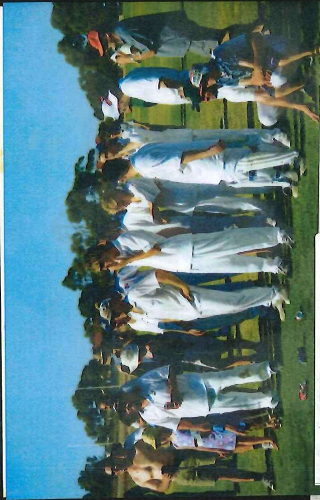
A2 Premiers Presentation time