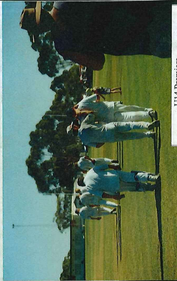
U14 Premiers Winners are grimmers