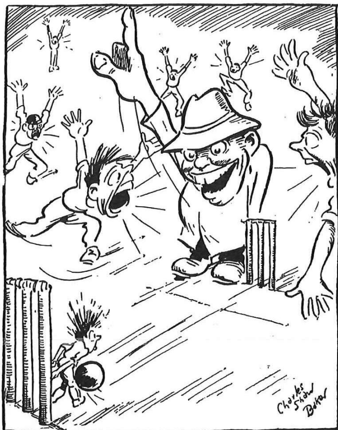
What it feels like to be LBW first ball.